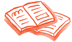
Increase in school attendance