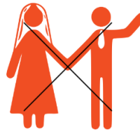
Decrease in child marriages