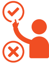
Improvement in girls' decision-making